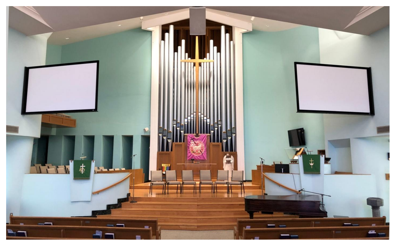
The Welcome Statement of Jackson's First Presbyterian Church:

Welcome... No matter who you are or where you are on life's journey, you are welcome in our church. If you are young or old, you are welcome here. If you have brown skin, black skin, white skin, people of all races are welcome here. If you are married or single, you are welcome here. If you are gay or straight, or both or neither, you are welcome here. If you are a man or a woman, transgender or non-binary, you are welcome here. If you are sick or well, you are welcome here. If you are rich or poor, powerful or weak, you are welcome here. If you believe in God, or if you don't, you are welcome here.